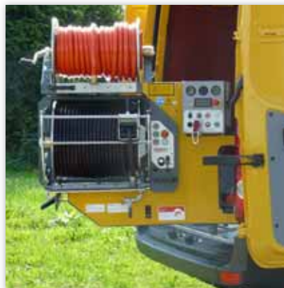
Simultaneously rotating control box, finished in high gloss grey metallic paint (RAL 9023)