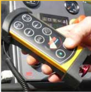
Remote control Professional Yellow