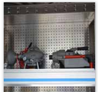
Aluminium tool storage cabinet (top view)