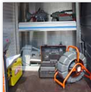
Aluminium tool storage cabinet