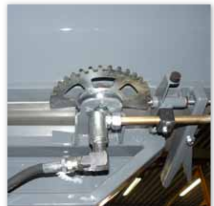
Durable locking device: lockable at any angle of the HP reel