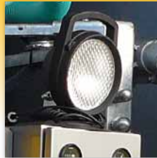
Working light on magnetic bracket