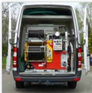
Spraypainted in one company or municipality colour