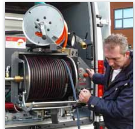
Simultaneously rotating control panel, finished in basalt grey (RAL 7012)