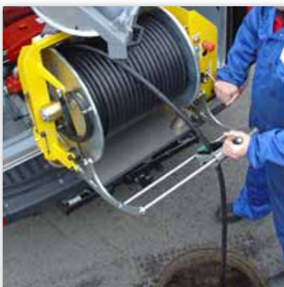
Simultaneously rotating stainless steel drip tray