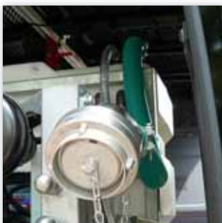
Extendable Storz coupling with filter