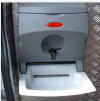
Warm water hand washing unit