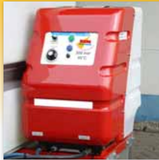
Hot water unit, package fully integrated on HP machine