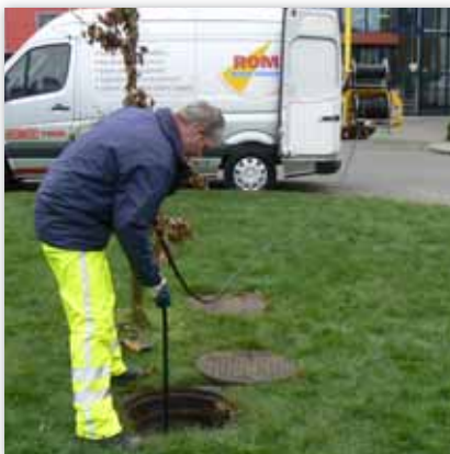
Fully hydraulically operational 270° rotational HP reel

* Choice tank capacities: 600, 800, 1000, 1200, 1350, 1600, 1800, 2000 and 2700 litres.