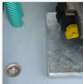
Waterproof floor in vehicle