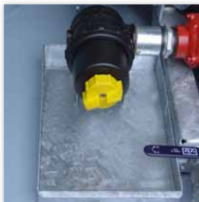
Water filter (2") with automatic stop valve