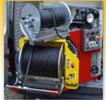
Reelframe incl. hose guider and 2nd optional HP reel