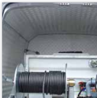
Full aluminium lining of 'wet compartment'