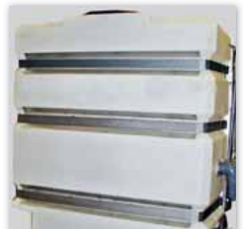
Extra capacity water tank